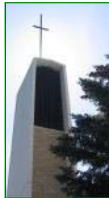
St. Patrick Cathedral's bell tower.

Knights continue to provide financial donations to St. Patrick Cathedral through "Friends of the Cathedral." Each year, we donate $250. The following projects are planned for 2018: