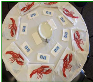
Table setting at the Lobster Supper.