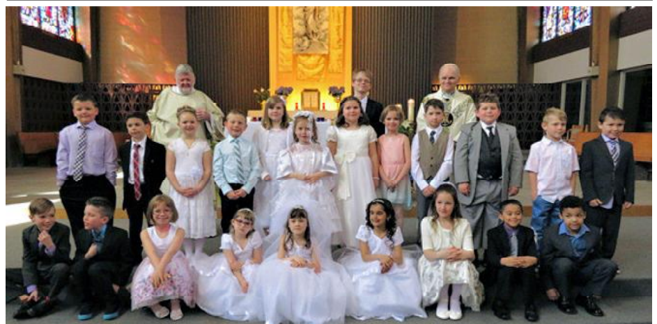
Cathedral First Communion Class 2018