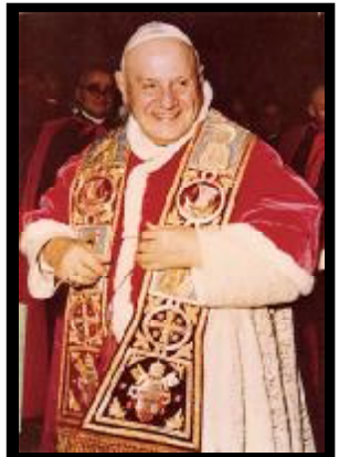
Pope St. John XXIII October 11 th