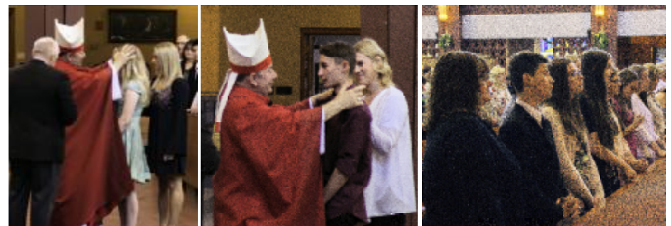
Cathedral Confirmation Mass 2018

Adults who have lost a loved one in the last two years and would like to participate should contact the Parish Office at 622-5389 to register. The Program is free and all materials will be provided. The 2 hour evening sessions will be held in the Rectory meeting room.