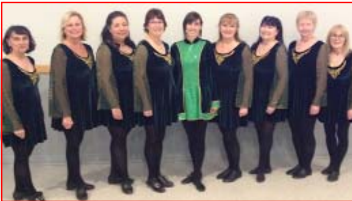
Dancers at Irish Night.

Once again, the Irish Night Dinner and Dance, held in March at the Columbus Centre, was a great success. Many participants wore green! The menu consisted of corn beef, turkey, cabbage, turnip, mashed potatoes, green beans, mushrooms, carrots and ice cream with mint.