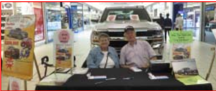
Selling car draw lottery tickets at Intercity Mall.

Participation in the annual K of C lottery was a great success. Many volunteer hours went into this project. Knights helped to sell 1,460 tickets at $5 each for a total of $7,300. This will help us continue to give back to our community projects. Special Olympics, the Arthritis Society and our local charities are the beneficiaries of the lottery. Your support has been appreciated. Special thanks to all the volunteers and supporters. The draw date was May 31. Major prize winners were published on June 17 in the Toronto Star or visit www.ontariokofc.ca . Vehicle and cash winners will be notified by registered mail. The six local councils sold 16 winning tickets. Council 1447 had one $200 winner and two $100 winners.