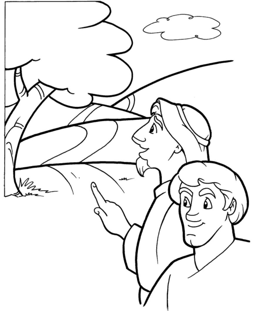
The Road to Emmaus