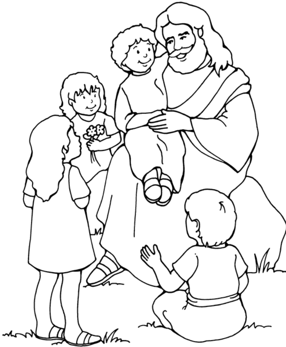
Jesus and the Children