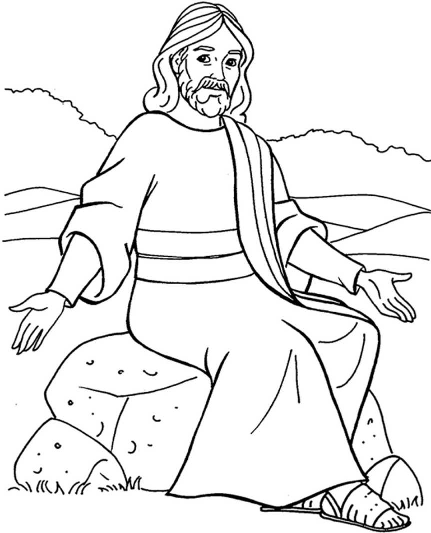
The Parable of the Weeds