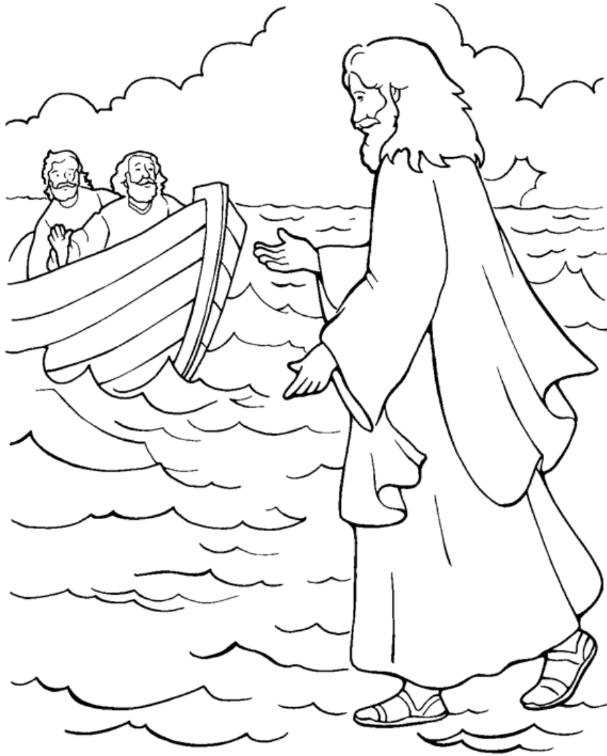
Jesus Walks on Water

From Thru-the-Bible Coloring Pages © 1986,1988 Standard Publishing. Used by permission. Reproducible Coloring Books may be purchased from Standard Publishing, www.standardpub.com, 1-800-323-7543.