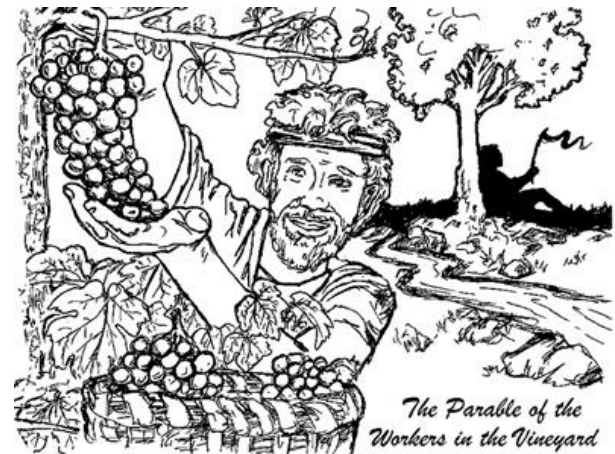
The Parable of the Workers in the Vineyard