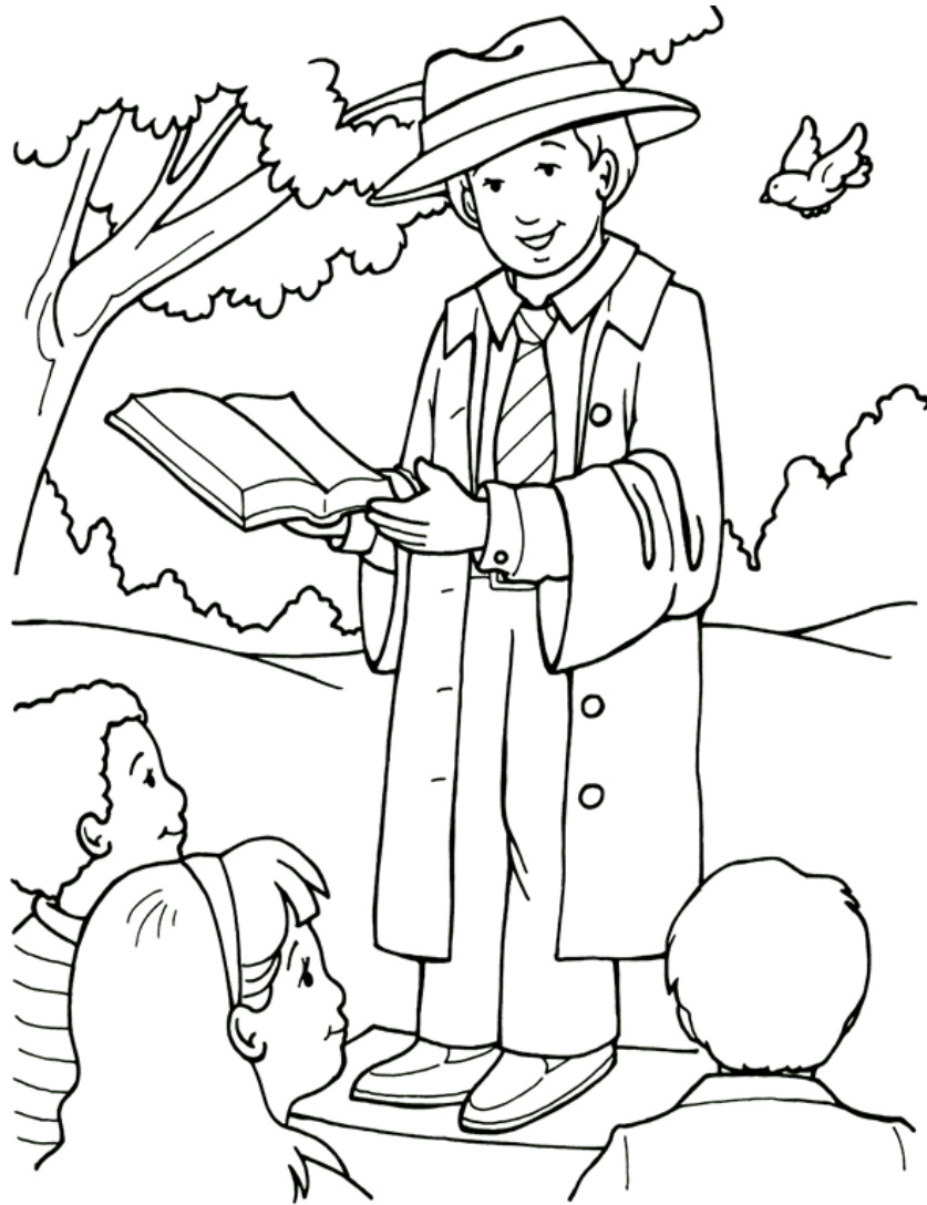
Inviting others to Jesus.

Each number represents a letter of the alphabet. Substitute the correct letter for the numbers to reveal the coded words.