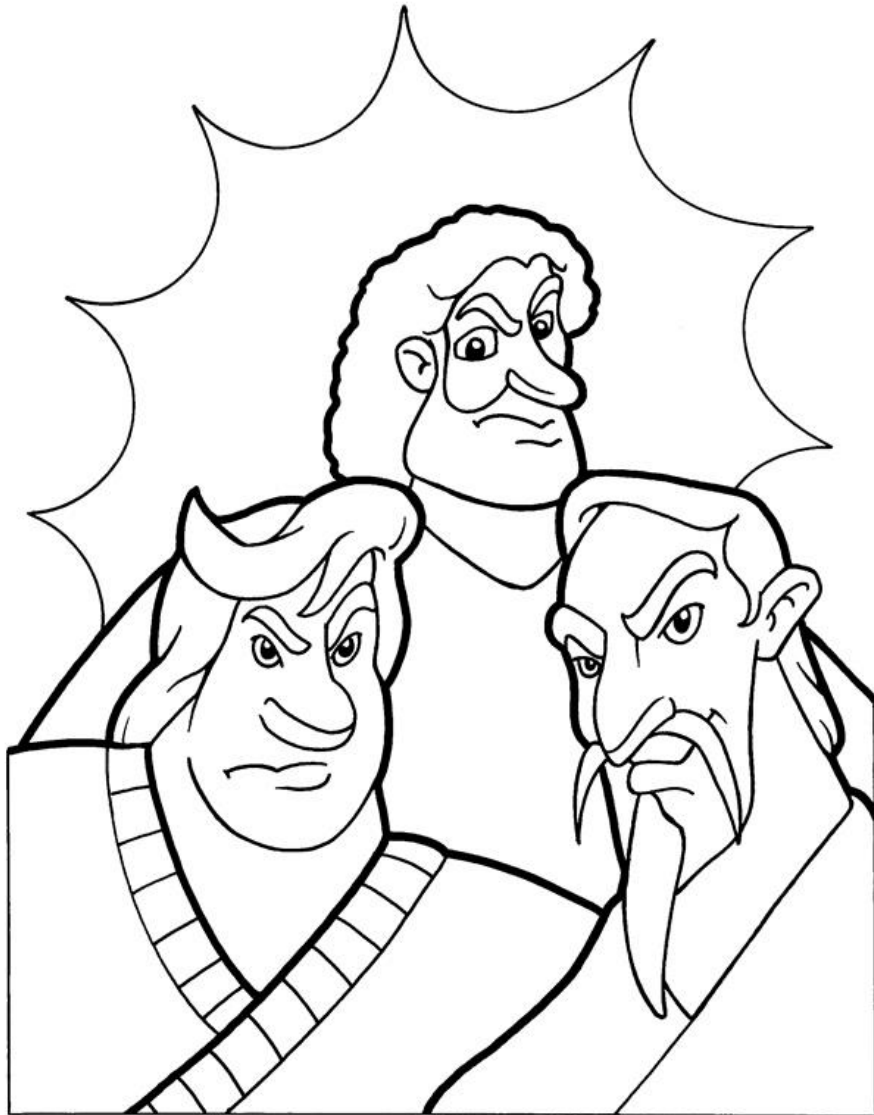
The Parable of the Tenants Matthew 21:33-46

Copyright © CalvaryCurriculum.com Used by Permission