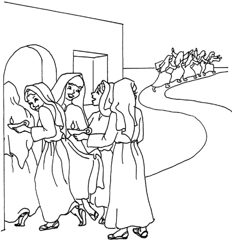
The Parable of the Ten Bridesmaids Matthew 25:1-13