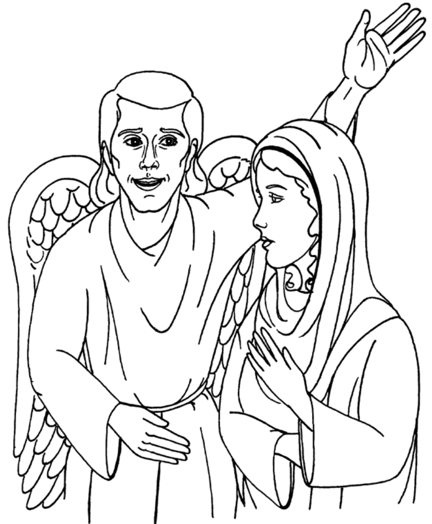
The Angel Gabriel Appears to Mary Luke 1:26-38