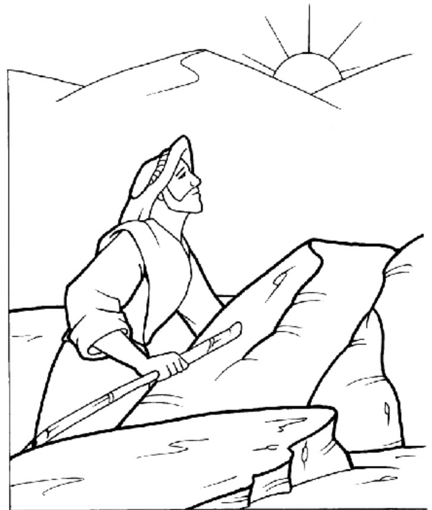
The Temptation of Jesus