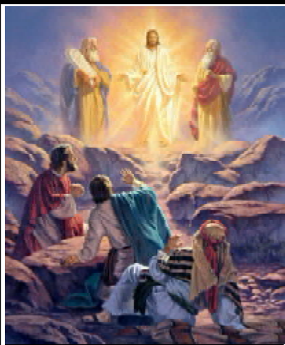
"He was transfigured before them" (Mark 9: 2-10)