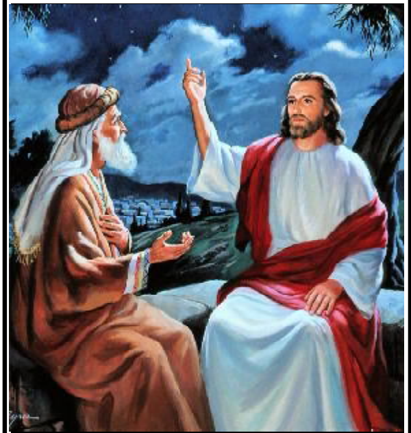
"For God so loved the world that He gave His only Son, so that all who believe in Him may have eternal life". (John 3: 14-21)

Letters, donations, and membership dues can still be sent by mail or delivered manually to the Office through the Rectory front door mail slot.