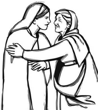
Mary Visits Elizabeth

Copyright © Sermons4Kids, Inc. May be reproduced for Ministry Use