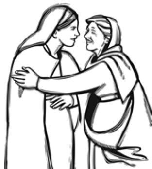
Mary Visits Elizabeth