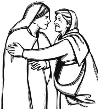
Mary Visits Elizabeth

Copyright © Sermons4Kids, Inc. May be reproduced for Ministry Use