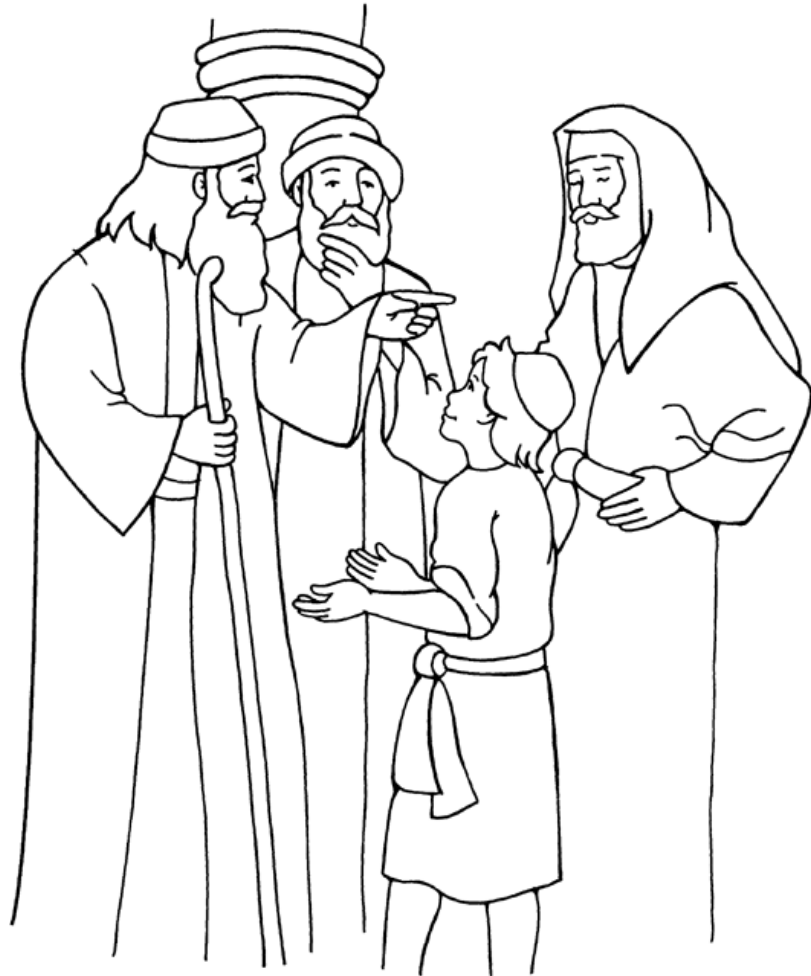
Jesus in the Temple Luke 2