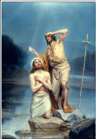
The Baptism of the Lord January 9, 2022