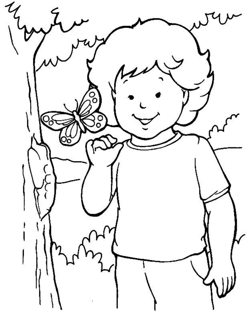
Jesus is special. He can do miracles.