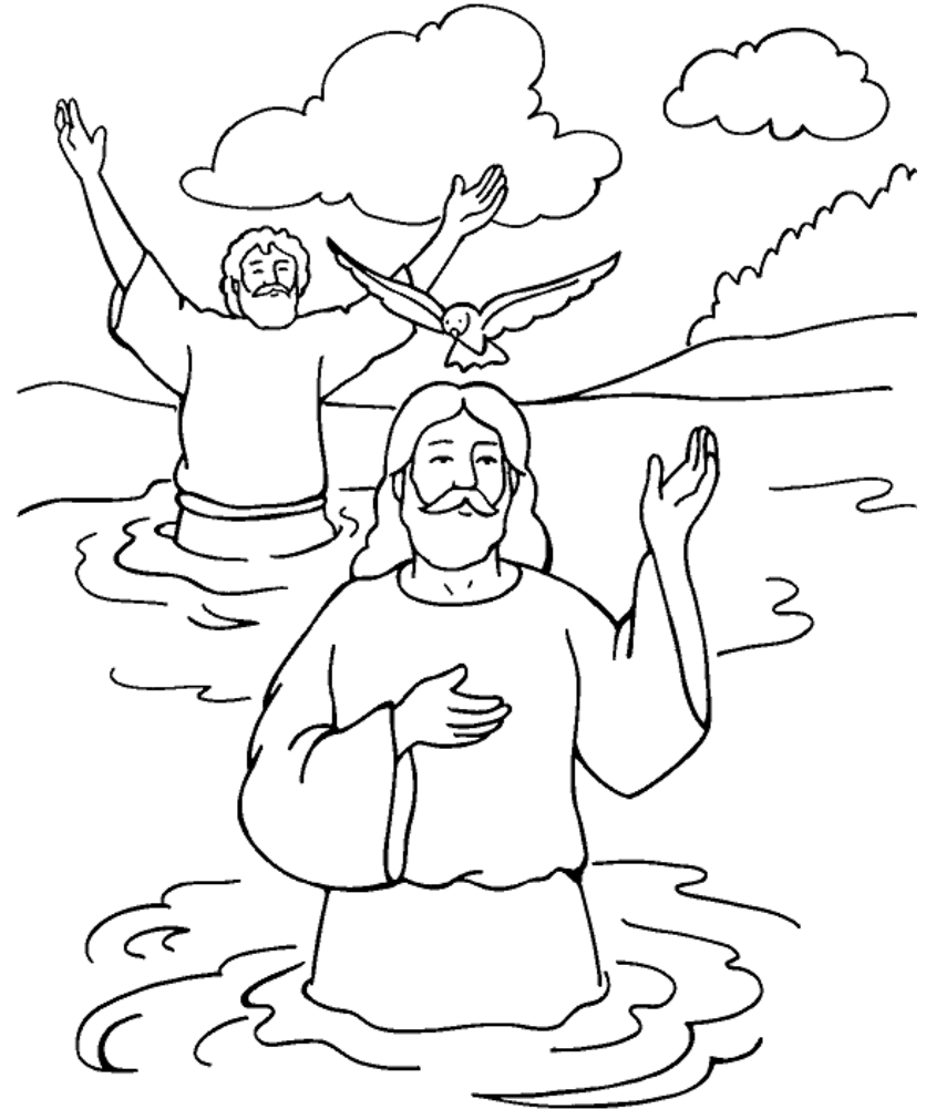
John Baptizes Jesus Matthew 3, Mark 1, Luke 3