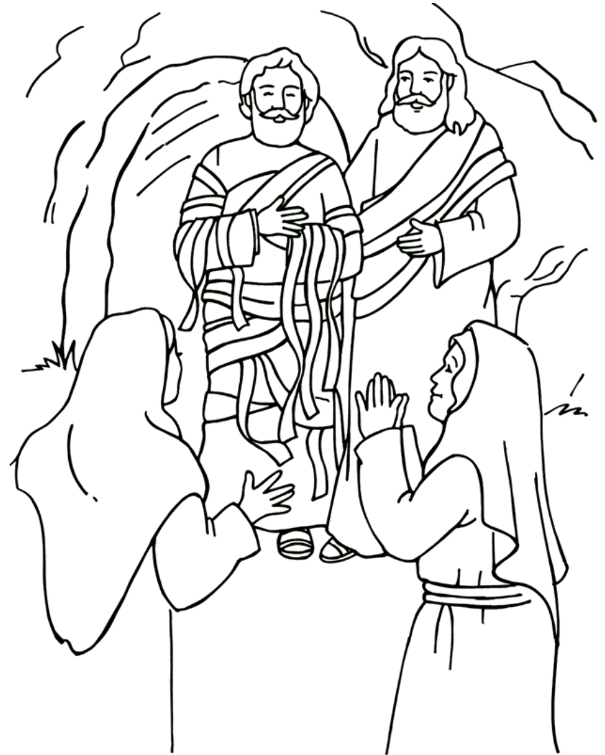
Jesus Raises Lazarus