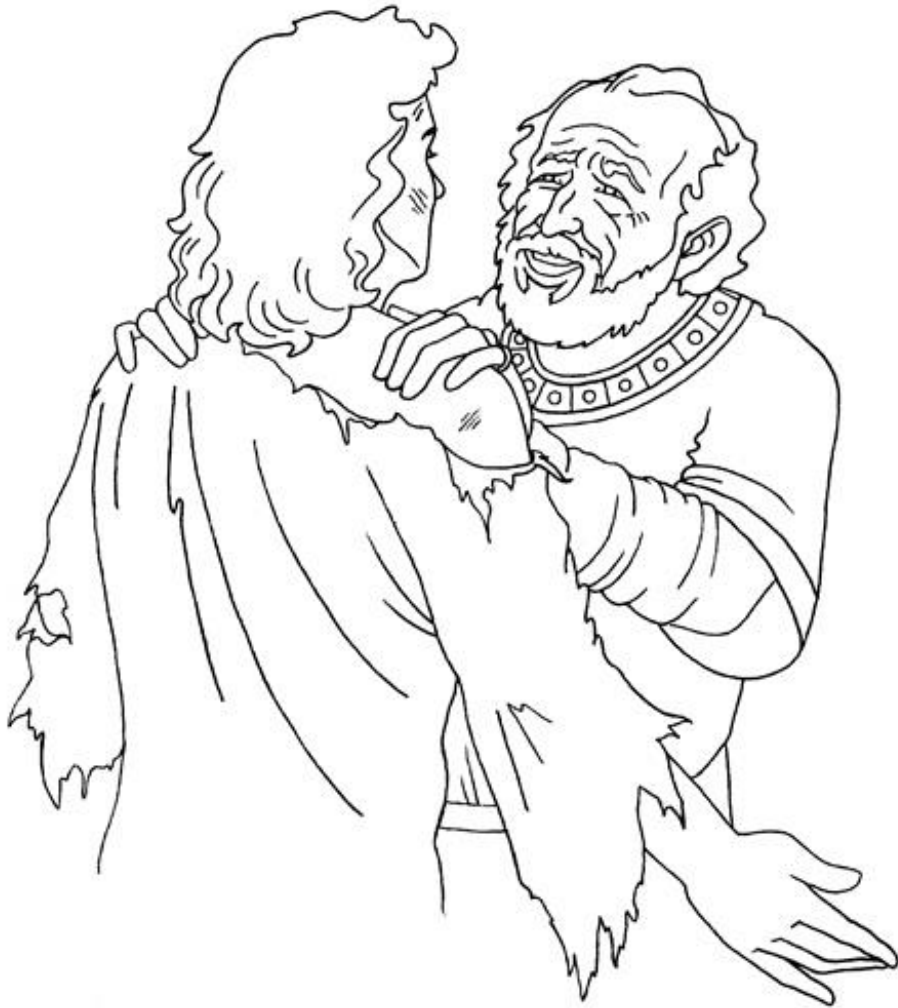
Jesus told the parable of the prodigal son. Luke 15:11-32

Copyright © CalvaryCurriculum.com Used by Permission