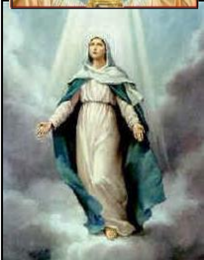
'Blessed be her glorious Assumption'