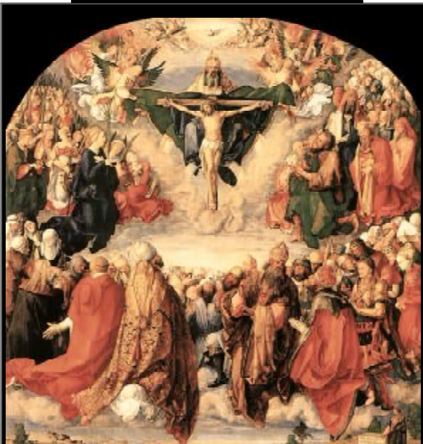
'Blessed be God in His Angels and in His Saints'

and Assumed into heaven (body and soul) at the end of her life. These two feasts are celebrated annually on December 8 th and on August 15 th .