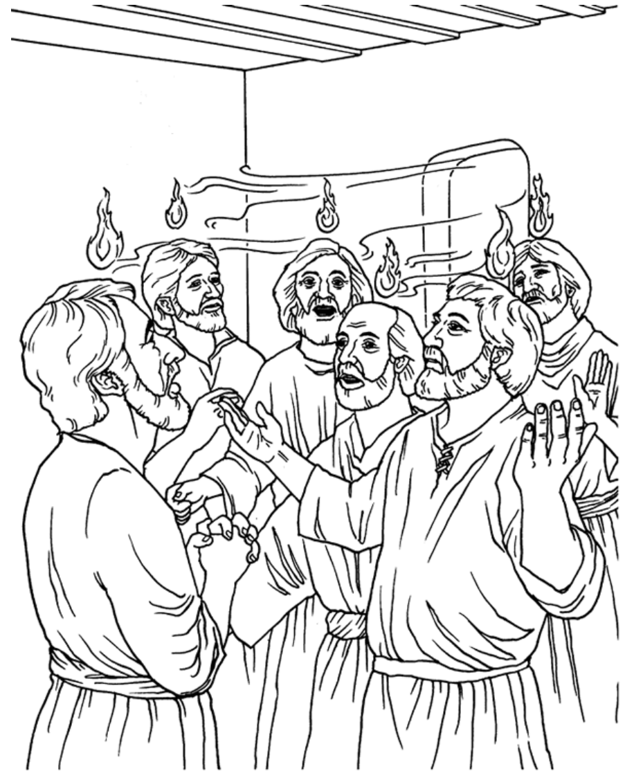
The Day of Pentecost Acts 2

From BibleStoryCard Learning System™ Coloring Book © 1996 Wesleyan Publishing House. Used by permission. Additional BibleStoryCard resources available by calling 1-800-493-7539 or visiting http://www.parable.com/wph/group_1052.htm