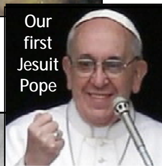
Our first Jesuit Pope