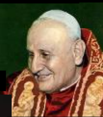
St. John XXIII