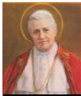
St. Pius X

St. John XXIII (1958-63) Affectionately called, 'the Good Pope' for his gentle manner, Angelo Roncalli , convened, in 1963, the 2 nd Vatican Council to renew the Church.