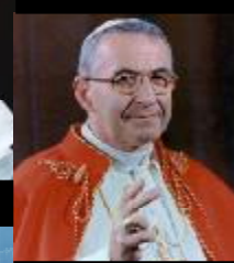
John Paul I