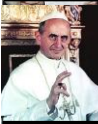
St. Paul VI