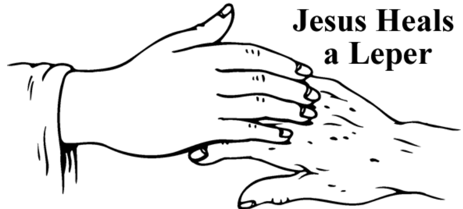
Jesus Heals a Leper