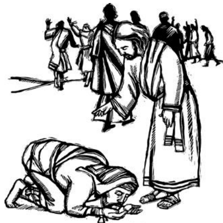
Jesus Heals 10 Lepers

Copyright © Sermons4Kids, Inc. May be reproduced for Ministry Use