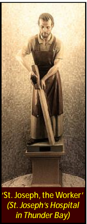
'St. Joseph, the Worker' (St. Joseph's Hospital in Thunder Bay)

Each year we commemorate Labour Day with a special Mass, not only as Canadians but also as persons of Faith. It is celebrated in thanksgiving for the value of authentic human work, which enables us to make use of our gifts and talents for the building up of our families and of our society. The Catholic Church teaches that work befits the dignity of the human person and that all true and creative work is made for us and not us for work! St. Joseph, Model of Workers