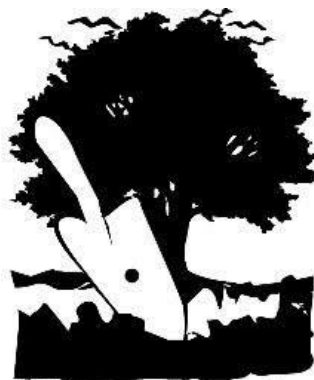
Mustard Seed Faith

Copyright © Sermons4Kids, Inc. May be reproduced for Ministry Use