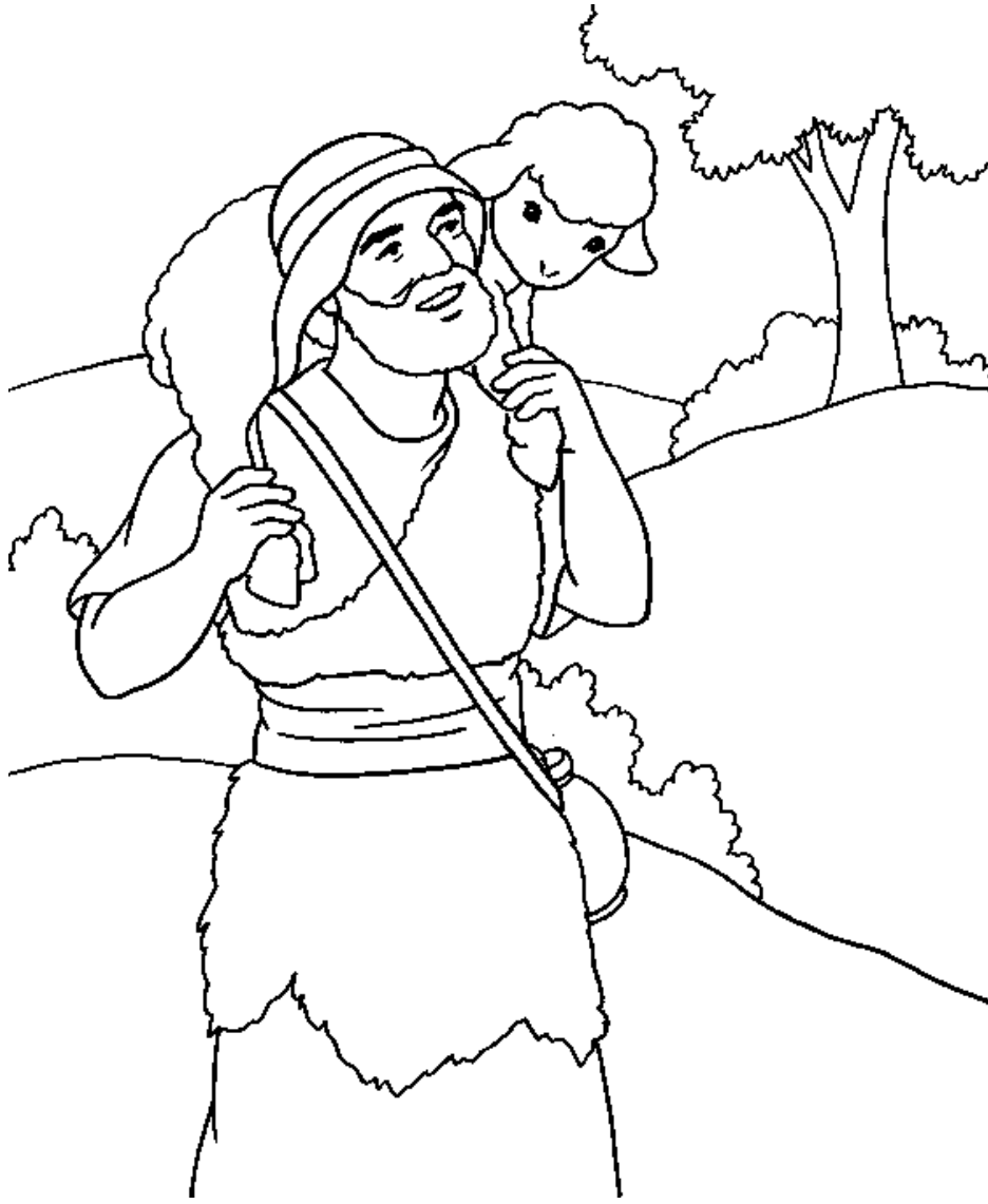
The Parable of the Lost Sheep