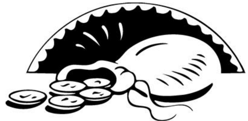
The Parable of the Lost Coin Luke 15:8-10