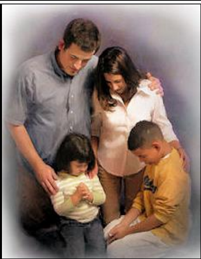
THE IMPORTANCE OF PRAYER (SUNDAY'S GOSPEL)