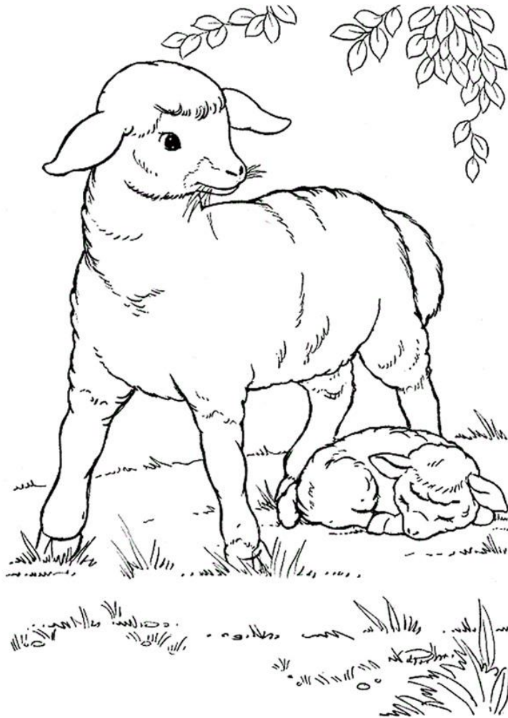
All We Like Sheep Isaiah 53:6