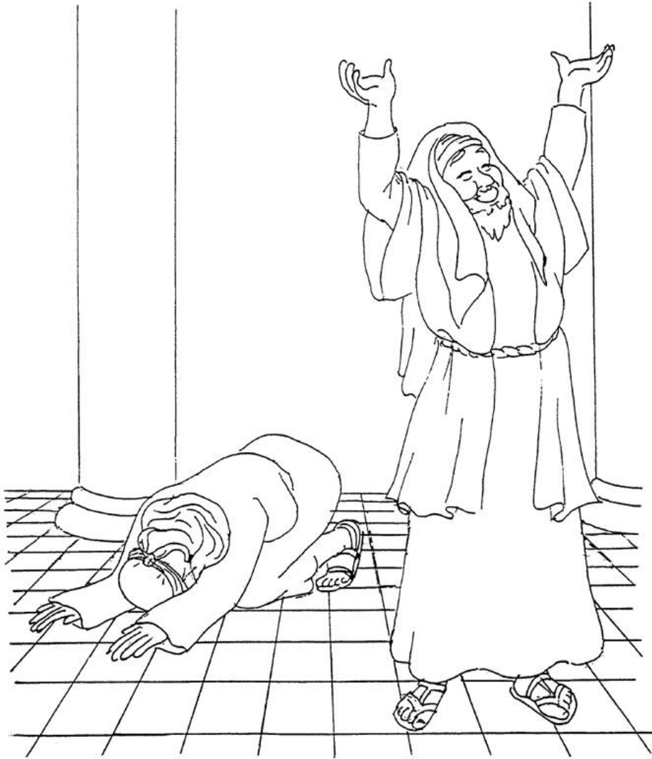
The Parable of the Pharisee and the Tax Collector