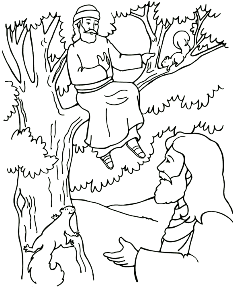
Jesus and Zacchaeus Luke 19

Each number represents a letter of the alphabet. Substitute the correct letter for the numbers to reveal the coded words.