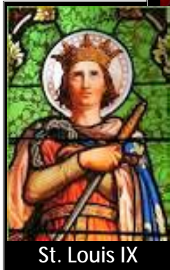
St. Louis IX

her husband's death, she herself joined the 3 rd Order of St. Francis, to emulate the example of its founder. Her Feastday is on November 17 th .