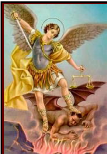
"War broke out in heaven: Michael and his angels fought against the dragon" (Rev. 12:7)

This Chapter speaks of "a pregnant woman, bright as the sun and with a crown of 12 stars around her head who gives birth to a son but, a red dragon is intent on devouring him."