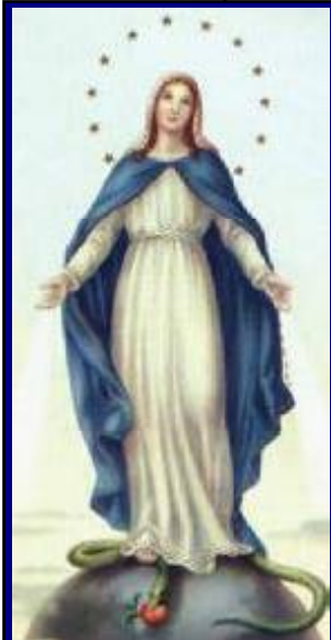
"Then a woman appeared, clothed with the sun and ... with 12 stars around her head" (Rev. 12:1)

some Christians teach that the Book actually contains secret codes which can help us determine the actual date of the end of the world. This is definitely not true.