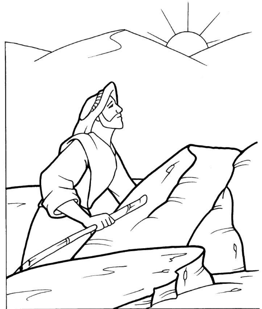
The Temptation of Jesus