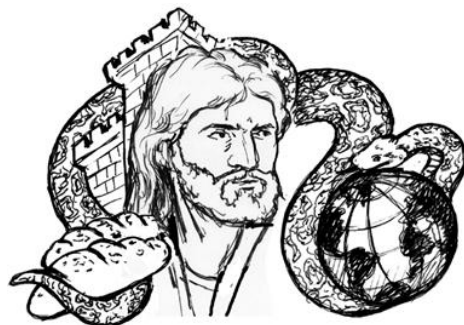
The Temptation of Jesus