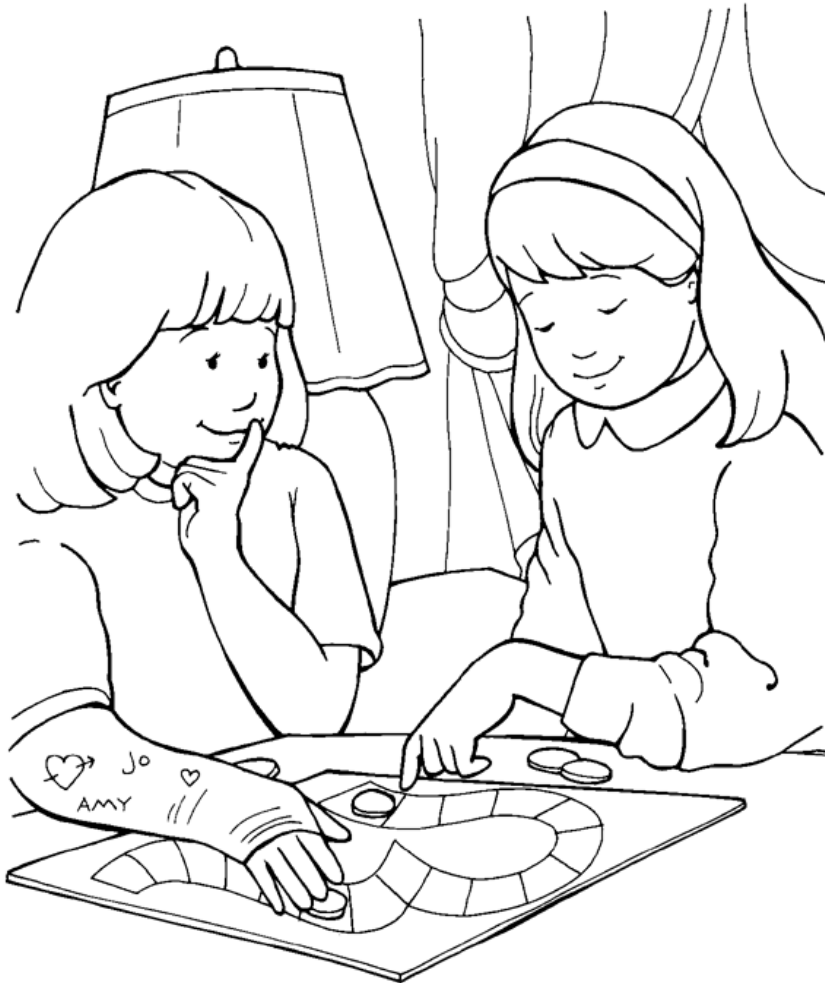
Showing Kindness Toward Others

From Thru-the-Bible Coloring Pages for Ages 4-8. Standard Publishing. Used by permission. Reproducible Coloring Books may be purchased from Standard Publishing, www.standardpub.com , 1-800-543-1301.