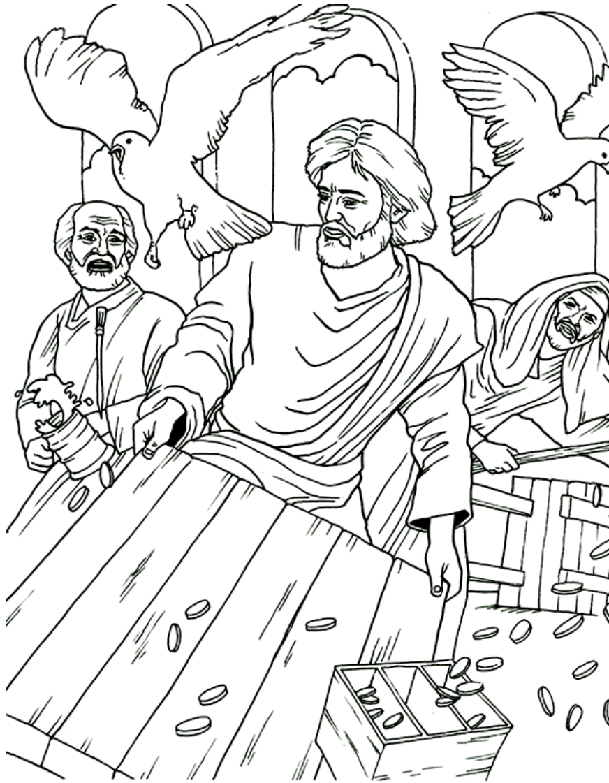
Jesus Cleansing the Temple

From BibleStoryCard Learning System(tm) Coloring Book © 1996 Wesleyan Publishing House Used by permission. Additional BibleStoryCard resources available by calling 1-800-493-7539 or visiting online http://www.parable.com/wph/group_1052.htm