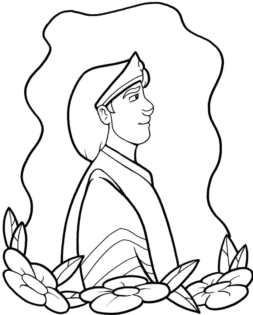
David, King of Israel

Copyright © CalvaryCurriculum.com Used by Permission