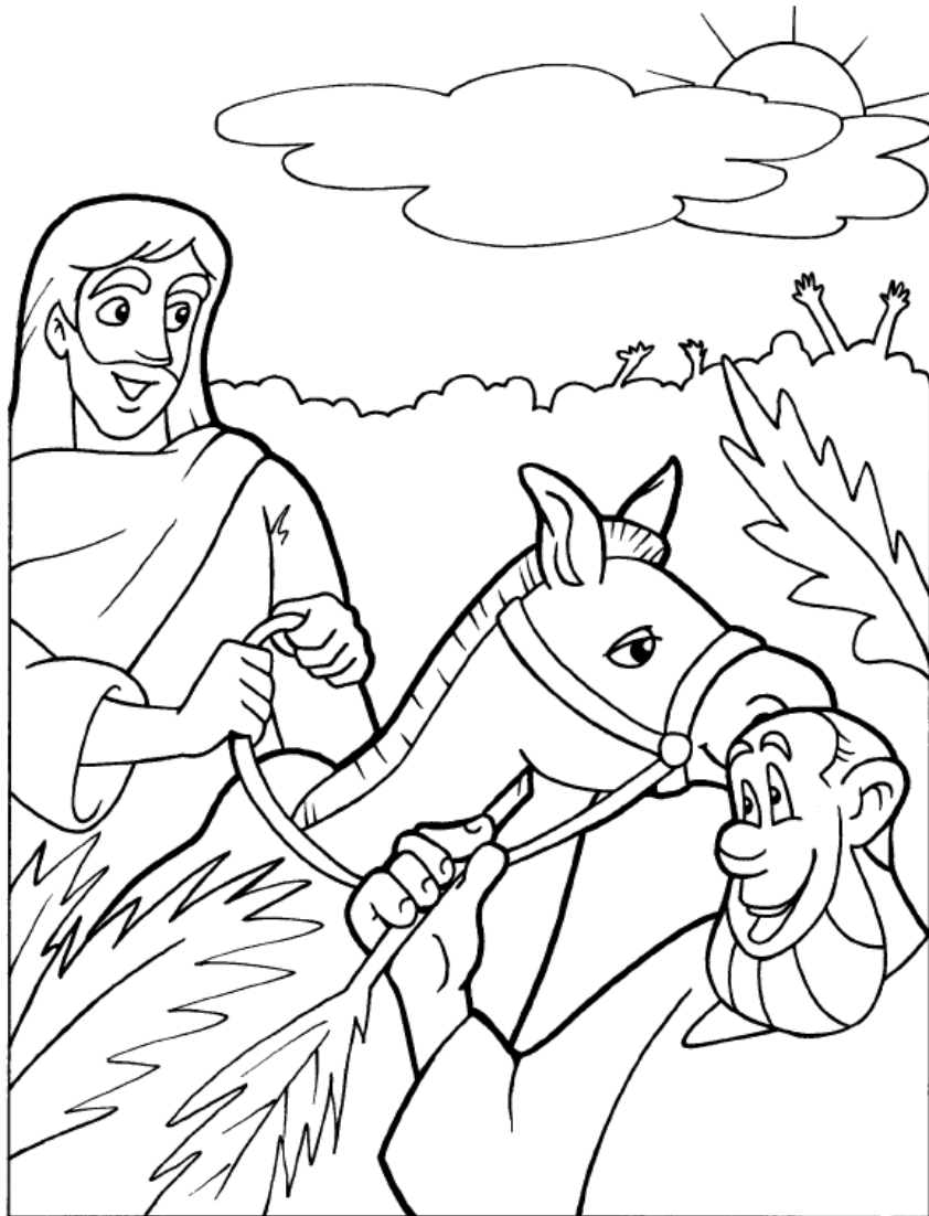
The Triumphal Entry