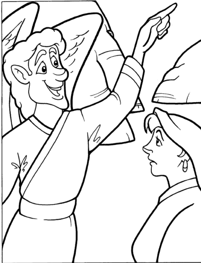
"He is not there, he is risen" Mark 16:6