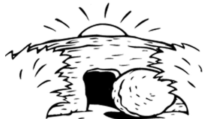
"He has risen! He is not here." Mark 16:6