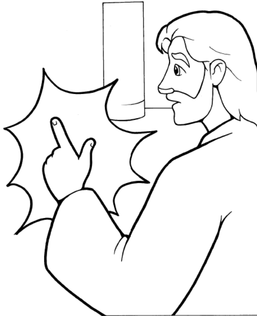
Jesus Appears to the Disciples

Copyright © CalvaryCurriculum.com Used by Permission