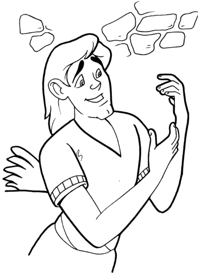
Jesus Heals a Withered Hand Mark 3:1-6

Copyright © CalvaryCurriculum.com Used by Permission