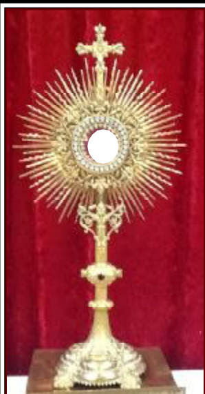
SOLEMN FEAST OF "CORPUS CHRISTI" THE BODY OF CHRIST