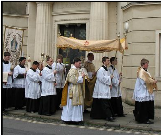
Corpus Christi Processions date back to the 13th Century

In the sixteenth century, during the turbulent times of the Reformation, some leading reformers denied the Sacramental Real Presence of Christ in the Eucharist. It was especially