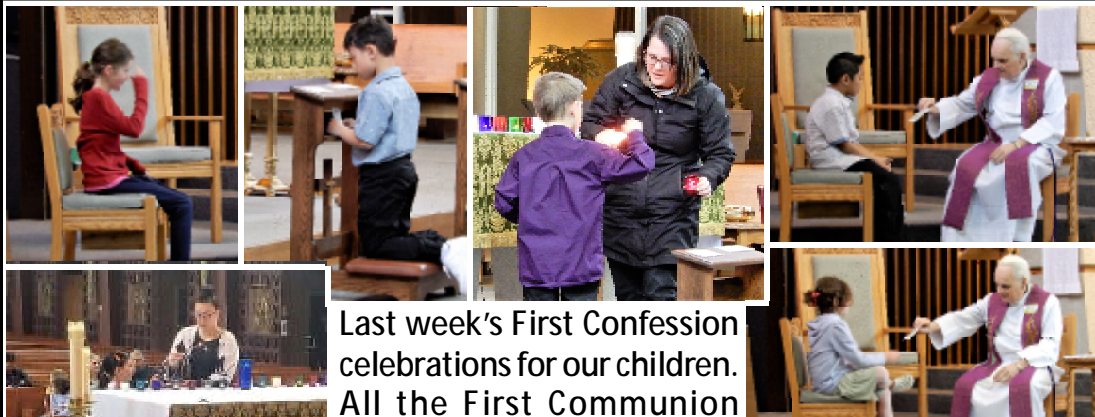
Last week's First Confession celebrations for our children. All the First Communion photos will be posted next week.