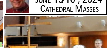
Many more photos on our Parish Website