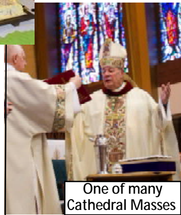
One of many Cathedral Masses