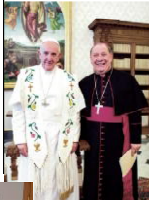
A Stole for Pope Francis

In 2007, the Indigenous Peoples of our area made him a Chief, giving him the name: "One who shares Good News".