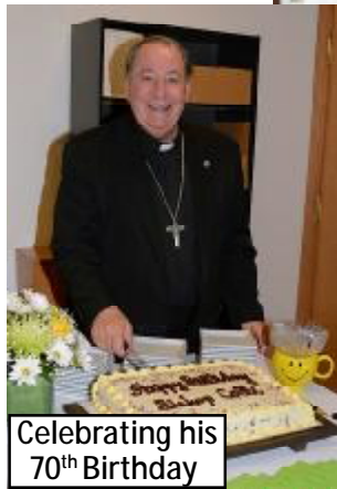
Celebrating his 70 th Birthday

On February 22, 1995, he was ordained a Bishop and was first appointed as an auxiliary Bishop of Ottawa. Then in February of 1999 he was named Bishop of Thunder Bay by